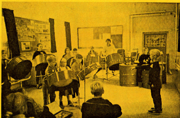
LEA GREEN CENTRE, Derbys