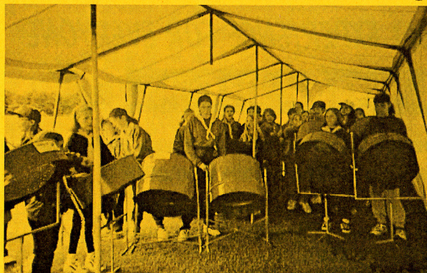
INTERNATIONAL GUIDE CAMP, Staffs

- Weekend and holiday events for churches, hospitals and youth & community groups of all ages eg. Guides, Scouts etc.